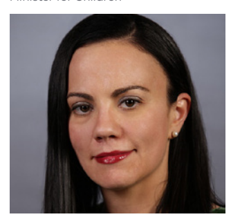
Hon Lizzie Blandthorn MP Minister for Children